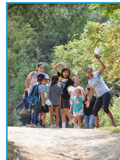
Shawnee North Nature Trail