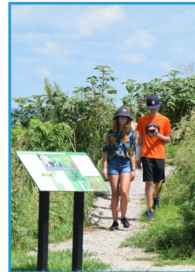
Azura Trails at Skyline Park

Shawnee County Parks + Recreation's nearly 60 miles of trails offer a leisurely stroll with side ventures into beautiful gardens, or a hike, run or mountain bike ride up hilly terrain leading to panoramic views of the county. There are 30 miles of paved trails and nearly 28 miles of natural surface trails running through forested, prairie and open natural areas. The Master Plan for Shawnee County Parks + Recreation calls for increasing the number and length of trails in our community while connecting as many as possible.